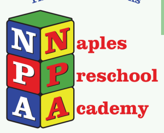
for a Bright Tomorrow

Naples Preschool Academy 1275 Airport Rd. S Naples, FL 34104