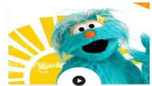
Family Caregiving Sunny, Stormy, Cloudy Days Podcast