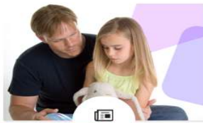
Health Emergencies Talking About COVID-19 With Children