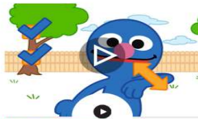
Health Emergencies Sneezing & Coughing Safely