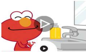
Health Emergencies Washy Wash