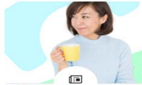
Health Emergencies Self Care