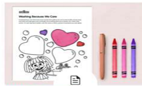
Health Emergencies Washing Because We Care