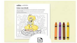
Family Caregiving Color Me Calm

https://www.pbslearningmedia.org/search/?q=34109