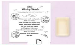
Health Emergencies Washy Wash