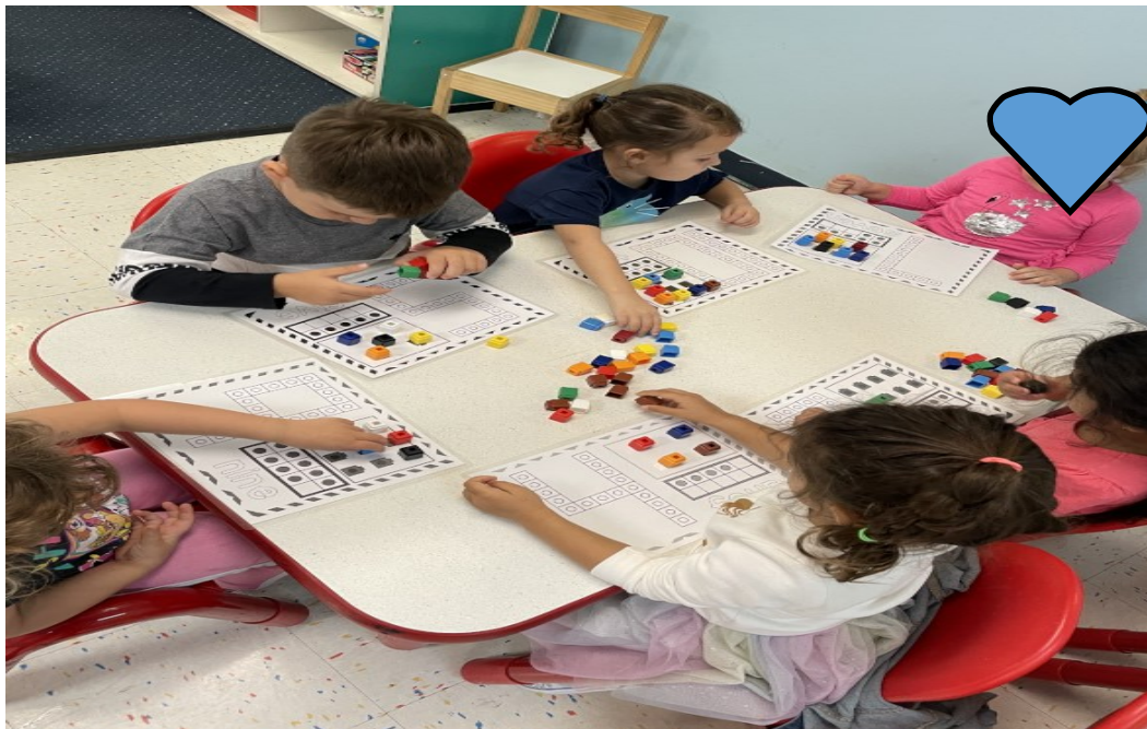
The children are hard at work